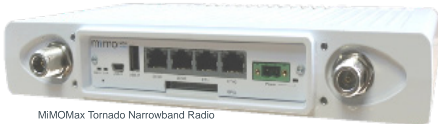
MiMOMax Tornado Narrowband Radio

Operating in the licensed frequency bands between 136-174MHz, 400-470MHz, 757-788MHz & 806-960MHz, the Tornado has a wide temperature operating range and optional waterproof outdoor mount. The Tornado enables unrivalled performance while maintaining MiMOMax's renowned reputation for reliability and operational efficiency.